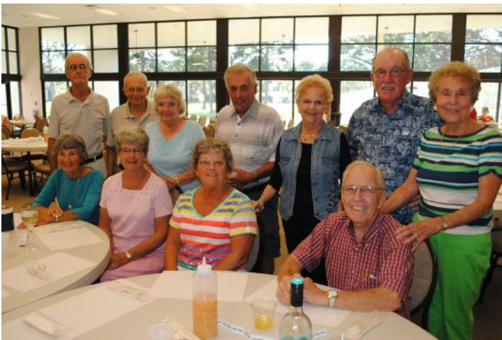
This group was very accommodating as we couldn't get them all in the picture while seated at their tables on Oct 18 at the Pasta Dinner.