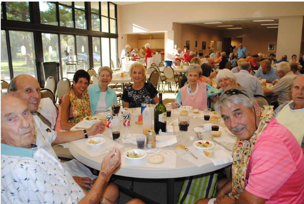
This is a good example of a happy, smiling table at our Pasta Dinner on October 18.