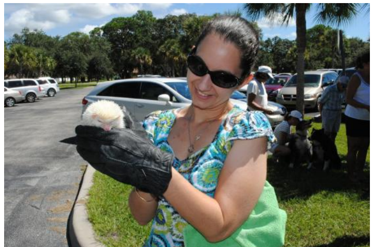
This young lady brought her hedgehog to the blessing on this October 6, 2013.

You can see about 44 photos of the event in the Photo Addendum which will be on the church website under K of C Newsletter. Members have it sent to them by e-mail.