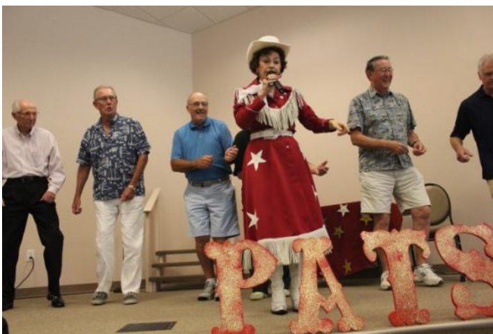
Patsy Cline pushes the men to dance on stage-Feb 16.