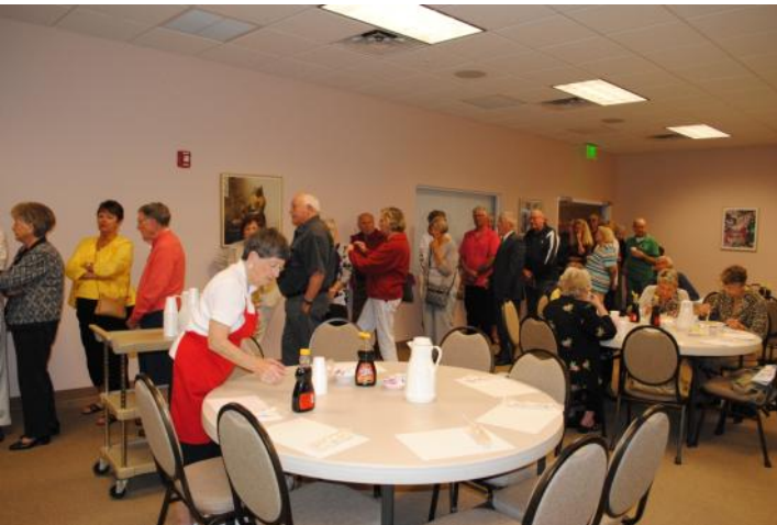
Breakfast crowd pours in after Mass on Feb 9.