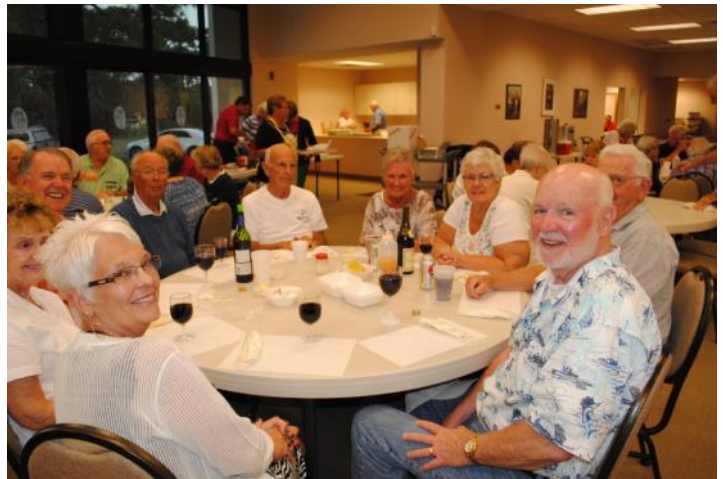
This is one of our happy pasta tables on Feb 21st.