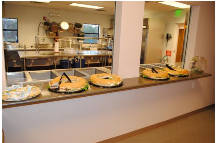
Round subs for the monthly business meeting-Feb 13.