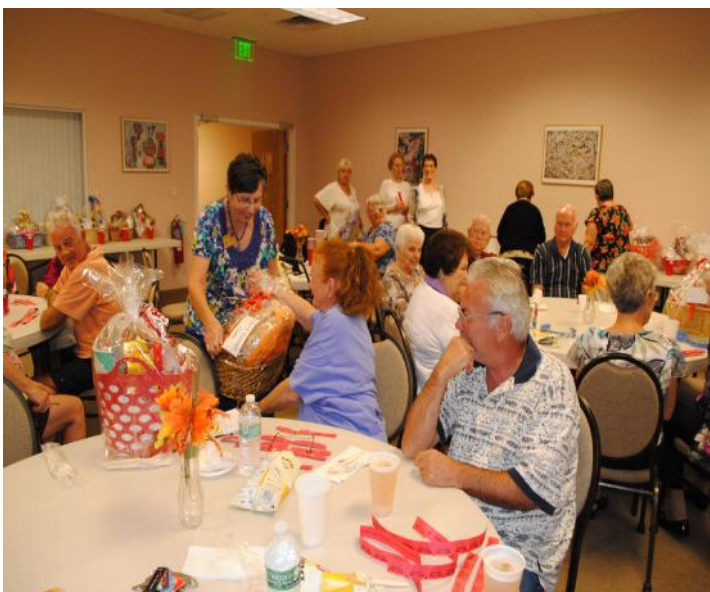
This redhead lady won three baskets plus one of the big 50/50 drawings. It looks like Christmas came early for her.