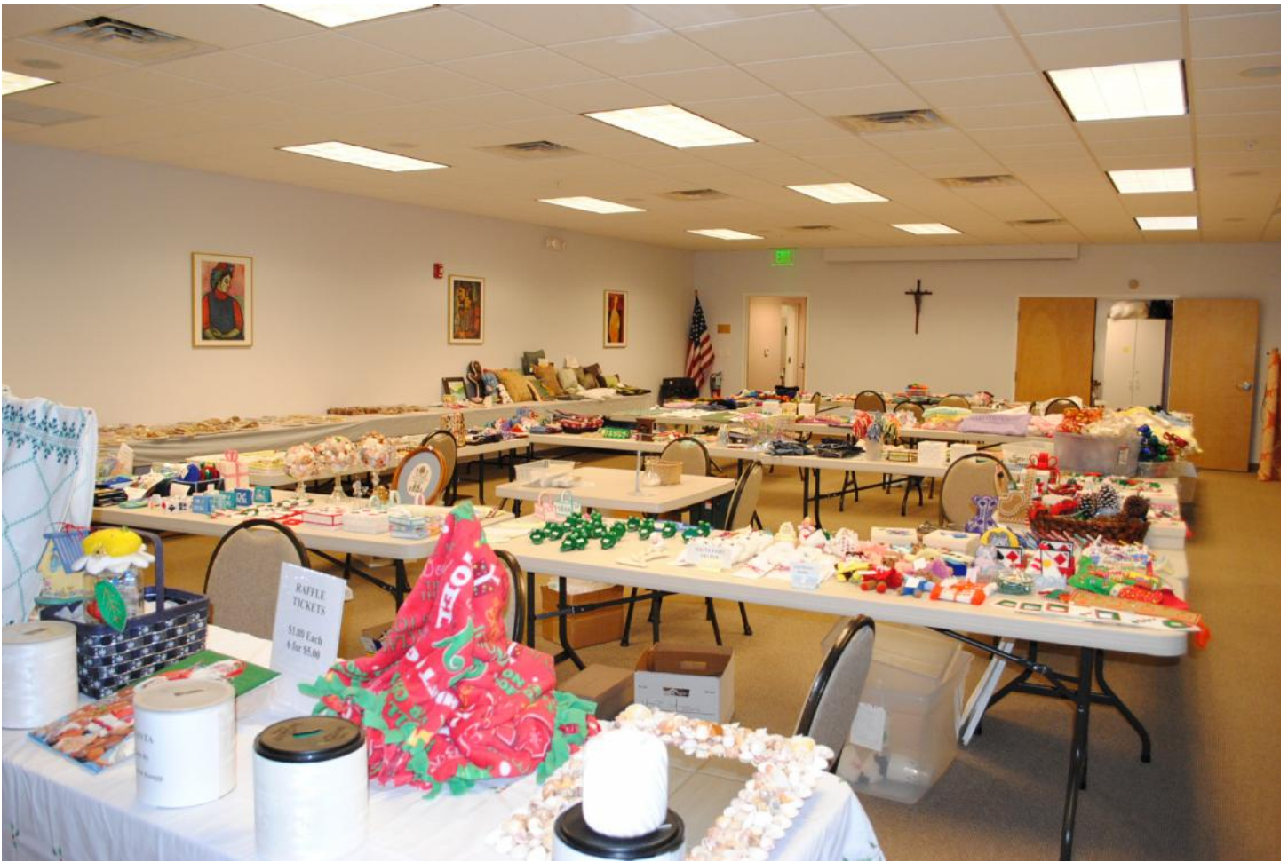
This is the display of the handmade articles just before the CCW Craft Sale began on November 15, 2013.