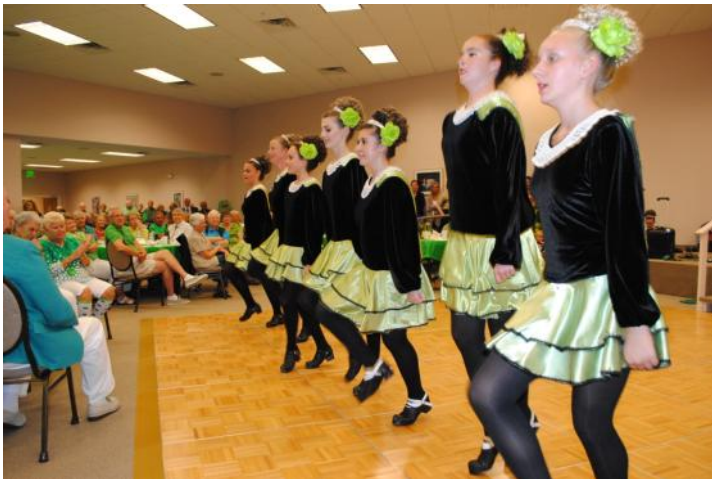
These young girls from the Irish Dance Academy of Sarasota demonstrate their clogging as a group. They participate in different competitions around the country.