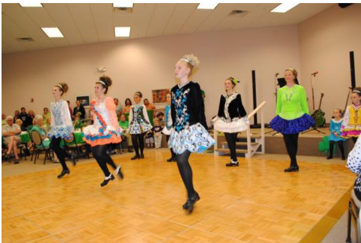
The girls show off some of their pretty dresses that they wear during competitions.